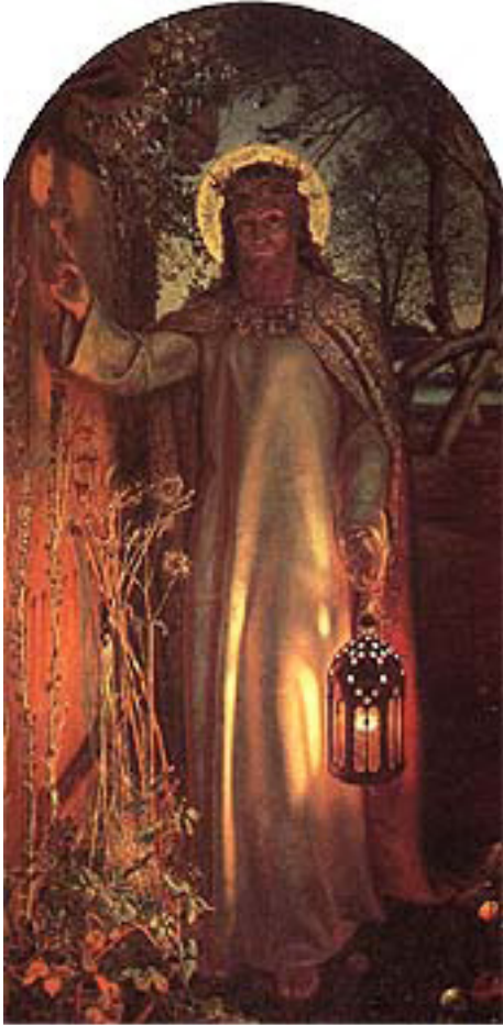
"Light of the World" (1851-53) British Pre-Raphaelite painter, William Holdman Hunt (1827-1910)

Most Episcopalians are scared of the book of Revelation. Some of that is due to its strange imagery. Some of that is how the book has been used to make crazy and often frightening predictions. During these unsettling times, Revelation is a book that, when explored properly, unlocks a world that, while radically different, speaks a message of hope and comfort to us.