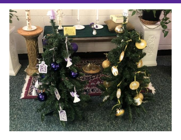
Hark the Herald Angels!

Last week our youngest parishioners made Christmas ornaments and decorated trees for donation to the East Tennessee Children's Hospital Fantasy of Trees