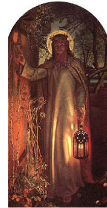
"Light of the World" (1851-53) British Pre-Raphaelite painter, William Holdman Hunt (1827-1910)

Most Episcopalians are scared of the book of Revelation. Some of that is due to its strange imagery. Some of that is how the book has been used to make crazy and often frightening predictions. During these unsettling times, Revelation is a book that, when explored properly, unlocks a world that, while radically different, speaks a message of hope and comfort to us.